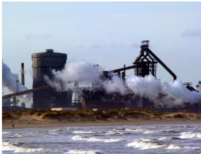
Restrictions around hazard sites can impose economic costs

NLP were asked by the Health & Safety Executive to investigate the economic costs of the land use restrictions imposed around major hazard sites, such as gas holders, petrochemical plants, pipelines and some chemical factories. The study will draw on case studies from around the UK, and consultation with local planning authorities, to develop a methodology that can be used to assess the impact of these restrictions on land and property values. It will also inform the HSE's responses on planning proposals and any consideration of changes to consultation areas around hazard sites.