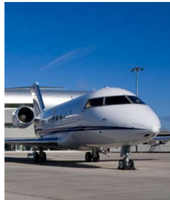
Business jet at Farnborough

On behalf of CLG and BERR (now BIS), NLP facilitated a workshop in May on the future role and content of single regional strategy. The event was attended by representatives of regional planning bodies, Government Offices and Regional Development Agencies (RDAs) from every English region. The workshop helped inform the government's consultation Policy Statement released in August.