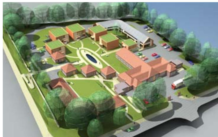
Creative Industries Centre, 3 Acre Park, Gateshead

To support proposals for 'move-on' accommodation for creative businesses in Gateshead, NLP examined the important role that this sector can play in delivering economic growth. NLP analysis showed that growth in creative industries has outstripped other sectors in recent years, so that attracting a greater proportion of such businesses could enhance local economic performance. Creative industries also have spin-off effects on competitiveness, acting as 'early adopters' of innovative technologies that then 'spill over' into other industries.