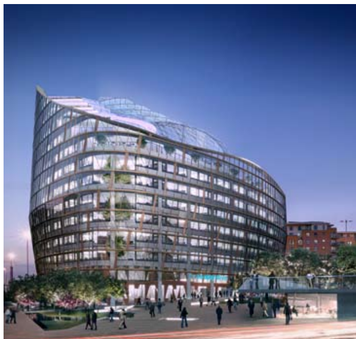
Visualisation of Co-operative Group HQ courtesy of 3D Reid Architects

Once developed, this landmark building will be the largest commercial office building in Manchester accommodating 3,500 staff, marking the first phase of redevelopment and regeneration of the Group's eight hectare site.