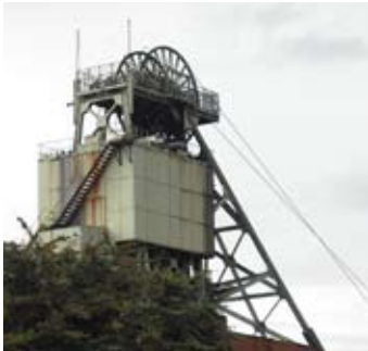
Welbeck colliery, Bassetlaw