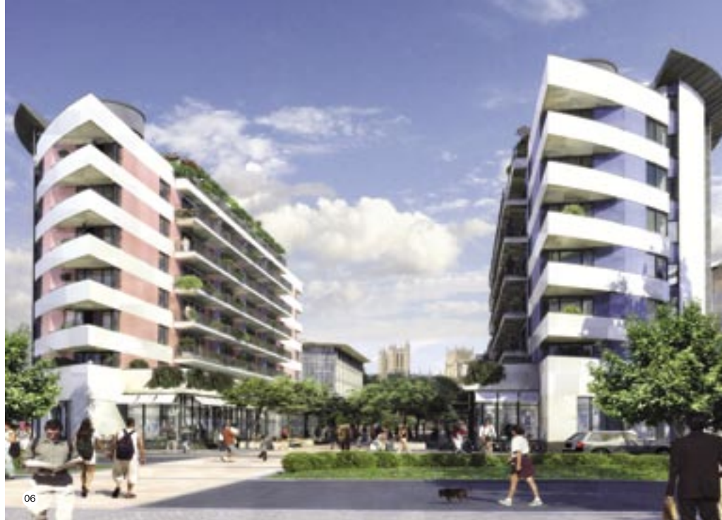
06 – Bristol Harbourside Crest Nicholson (South West) Limited Architects: Edward Cullinan Architects