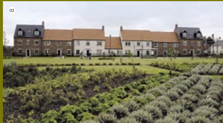
02 – Newcastle Great Park